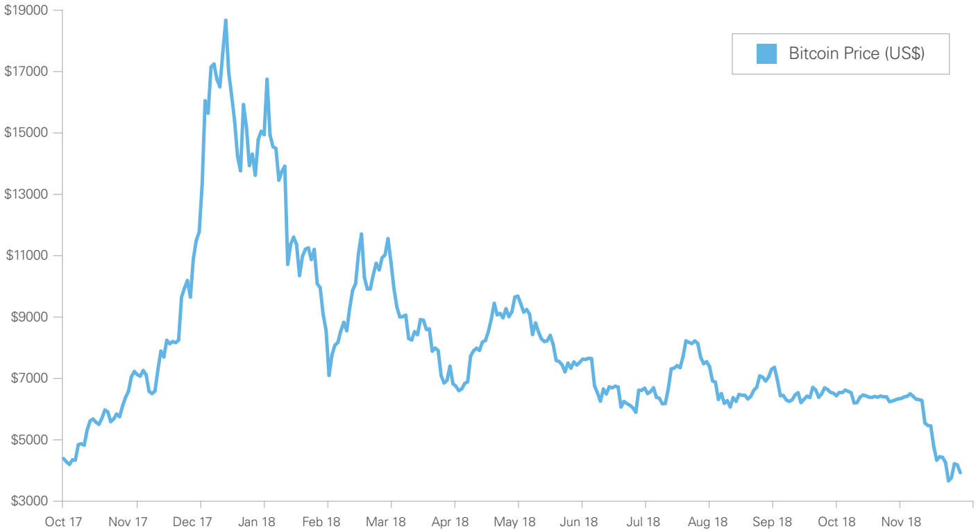
Chart of the Month: Bitcoin - What a Difference a Year Makes

At this time last year, cryptocurrencies were all the buzz at holiday parties and family get togethers. We can recall being engrossed in many such conversations with individuals with whom we had never spoken with about anything investment related. The original and most widely used cryptocurrency, Bitcoin, crossed the US$7,000 mark in November of 2017, and surged to nearly US$20,000 just before last Christmas. But as the saying goes, "all good things must come to an end." Bitcoin suffered a massive holiday hangover and moved generally lower throughout the year and experienced a deep downward cascade in November, closing the month below the US$4,000 level - a 79% drop from its peak.